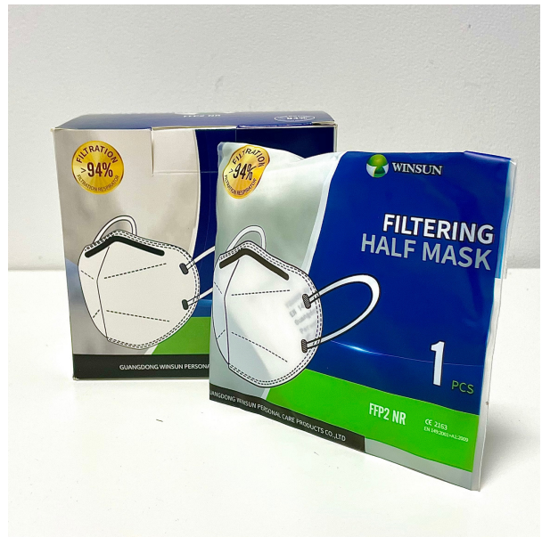
BOX & BAG