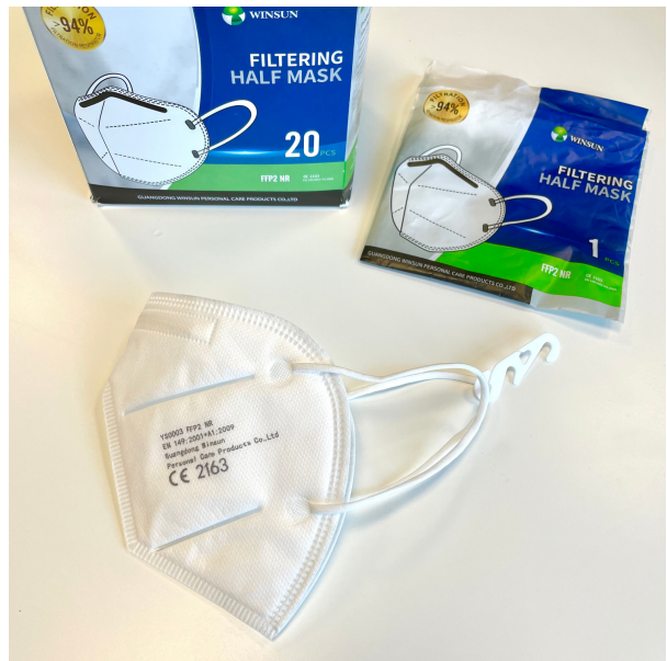
BOX, BAG, MASK